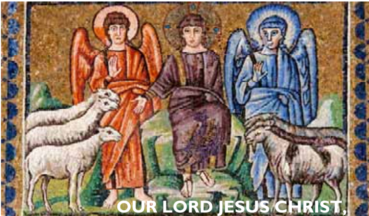
OUR LORD JESUS CHRIST, KING OF THE UNIVERSE

Amen, I say to you, whatever you did for one of the least brothers of mine, you did for me. Today we celebrate the feast of an unusual kind of king. Our Lord Jesus Christ, King of the Universe, does not run his kingdom in the standard fashion. Instead of insisting upon the pomp and circumstance that usually surrounds earthly royalty, Jesus has a different focus. He thinks not of himself, but of those he loves. And in today's Gospel, his interest is especially focused on the poor and suffering in our midst.